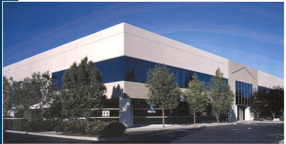
1505 Adams Drive, Menlo Park

FDA approved clean room. Improved bio-tech lab space.